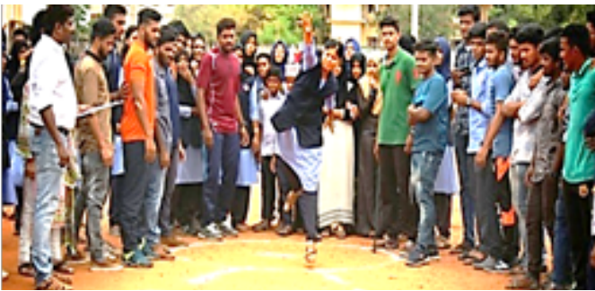
Annual Sports Day Captures...