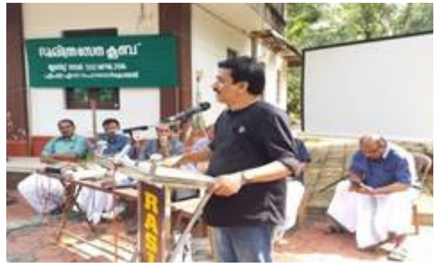
Observation of World Environment Day