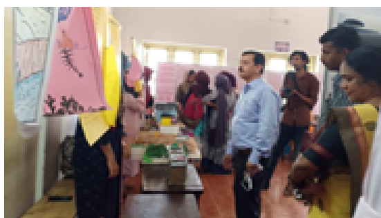
Observation of World Water Day