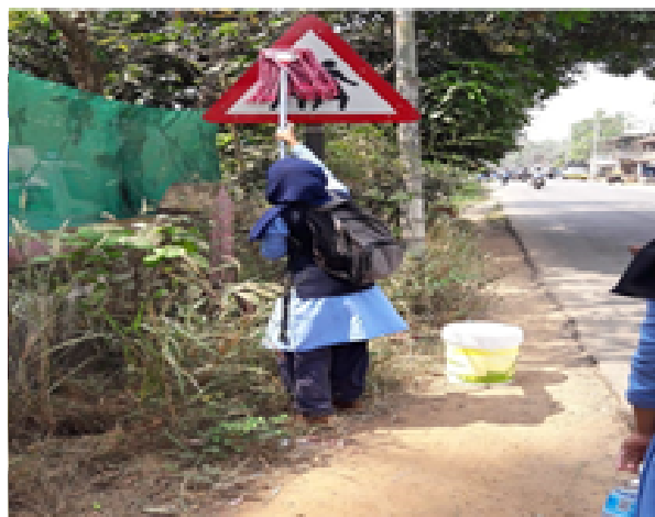
Traffic Awareness Programmes