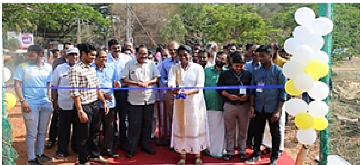
Inauguration of Cricket practicing net by Olympian Padmasree Dr. P.T. Usha