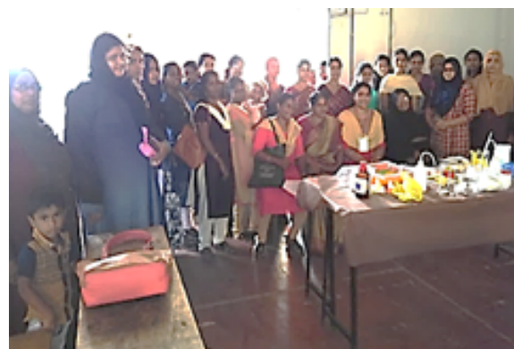
Training in soap and balm making, and detection of adulteration in food to kudumbasree members attended for the programme by the Department of Chemistry