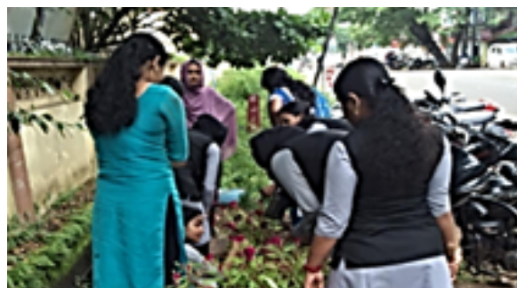
Road side beautification